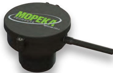
MOPEKA TD40 / TD200 NON-PRESSURIZED TANK SENSOR