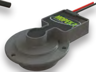
MOPEKA PRO200 NON-PRESSURIZED TANK SENSOR