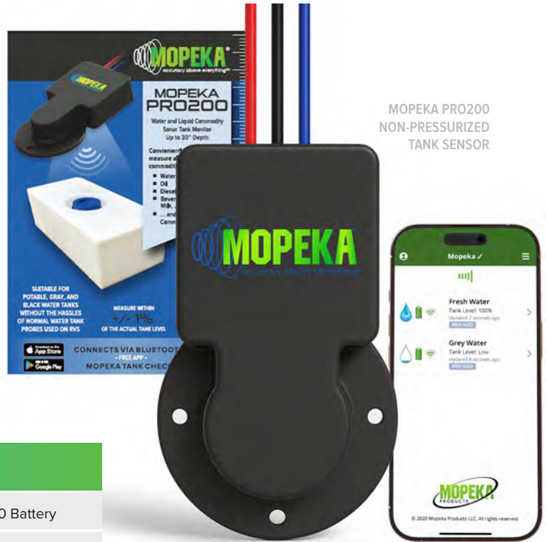
MOPEKA PRO200 NON-PRESSURIZED TANK SENSOR