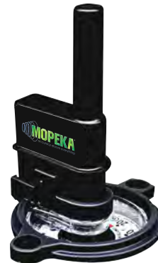
GAUGELINK – BLE

Built on Mopeka's promise of Accuracy Above Everything™ , GaugeLink delivers a flexible path to smarter tank monitoring.