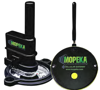
GAUGELINK - CELLULAR